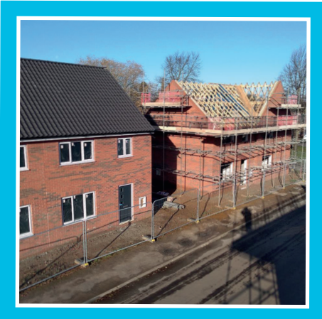
The progress at our homes in Walsoken.